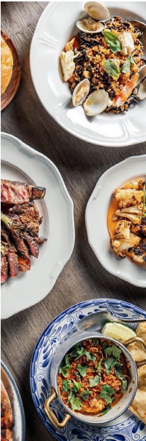
Takeout family-style from Etta, left, and veggie paella from Xiquet, below.