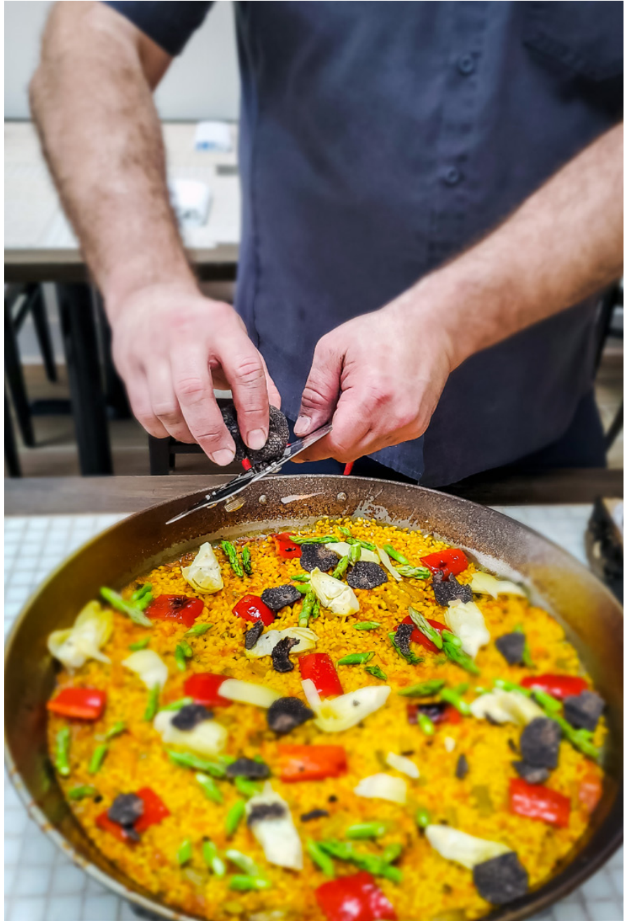
XIQUET PHOTOGRAPHY BY JENY BENITEZ