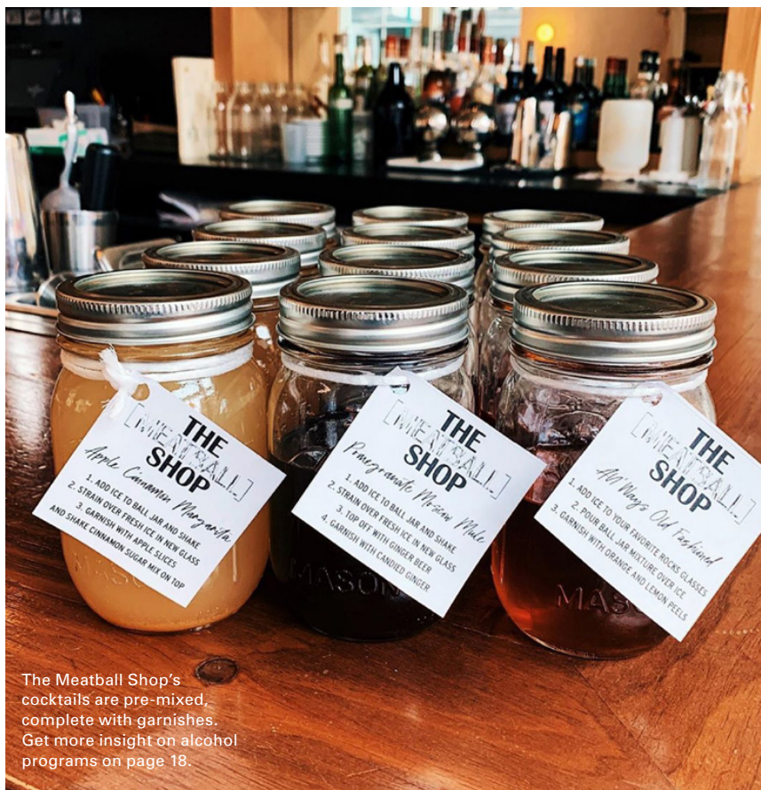
The Meatball Shop’s cocktails are pre-mixed, complete with garnishes. Get more insight on alcohol programs on page 18.

States that allow restaurants to sell alcohol should consider offering wine and alcoholic drinks to justify keeping some bartenders and sommeliers on staff and to round out family meals, but understand it’s not a panacea.