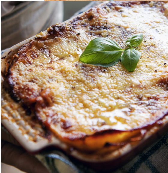
A fish fry with coleslaw and hush puppies from Ralph's on the Park, top, leg of lamb with spring vegetables from Xiquet and lasagna from Sunflowers and Greens.